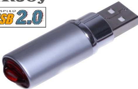
MOSCHIP Fast IrDA Adapter for Windows 7/Vista/XP/ME/98 and MAC OS X.