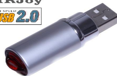
MOSCHIP Fast IrDA Adapter for Windows 7/Vista/XP/ME/98 and MAC OS X.