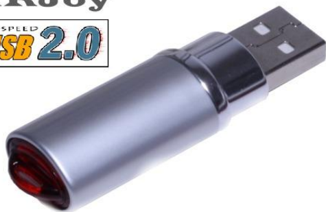
MOSCHIP Fast IrDA Adapter for Windows 7/Vista/XP/ME/98 and MAC OS X.