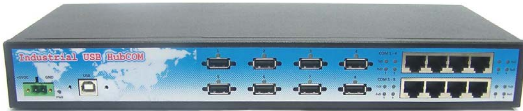
Diagram of HubCOM-880i-RM

The HubCOM-880i-RM provides a lockable terminal power connector to supply 5V, 3A power to external device.